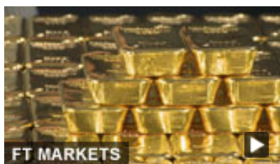
The gold market in 90 seconds