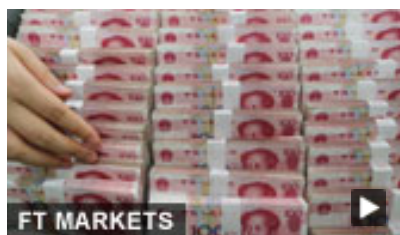
China's currency war explained